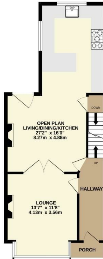
GROUND FLOOR 567 sq.ft. (52.7 sq.m.) approx.