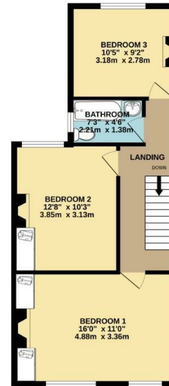
1ST FLOOR 521 sq.ft. (48.4 sq.m.) approx.